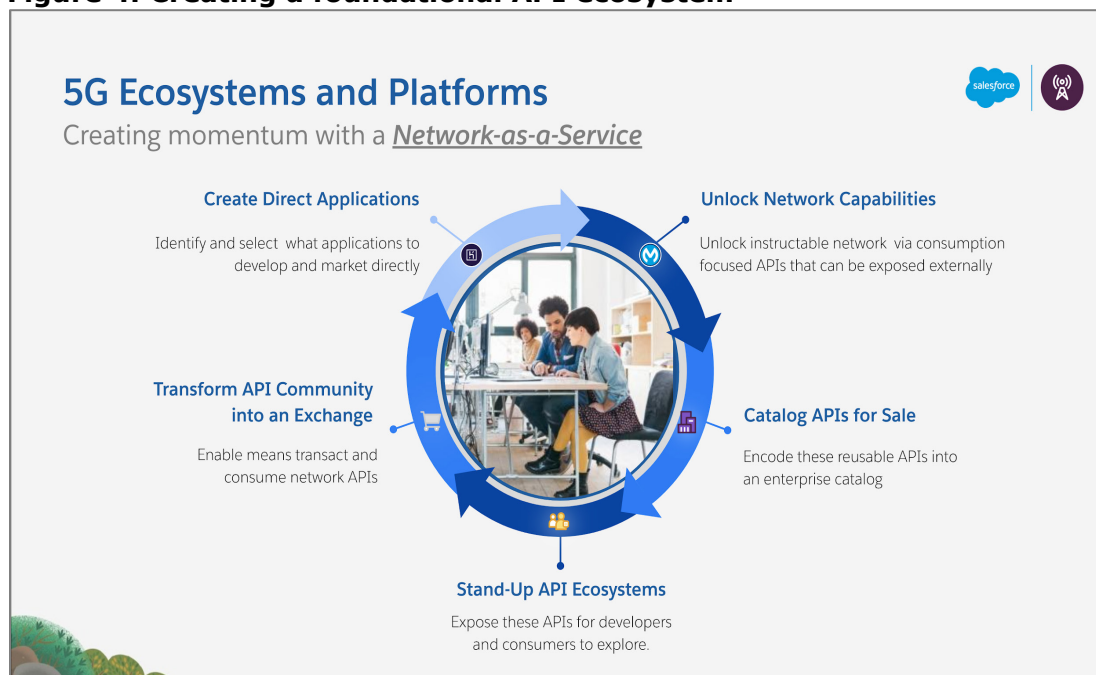
Figure 4: Creating a foundational API ecosystem